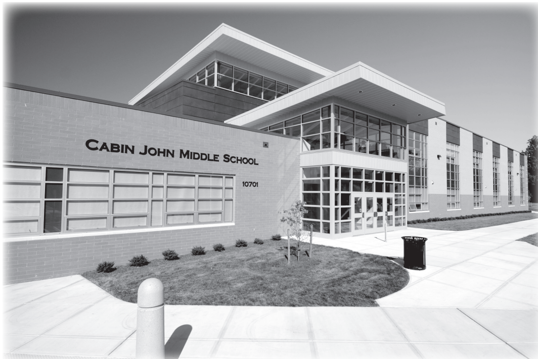
Cabin John Middle School

*Relocatables on site to address overutilization