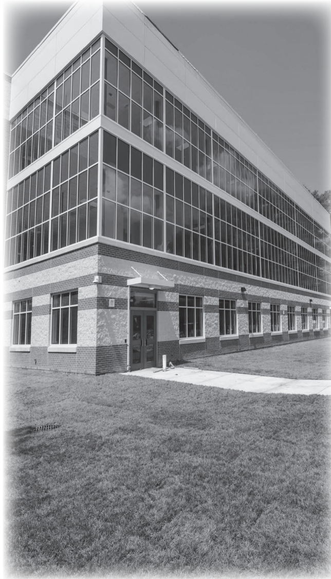
Walt Whitman High School

*Relocatables on site to address overutilization