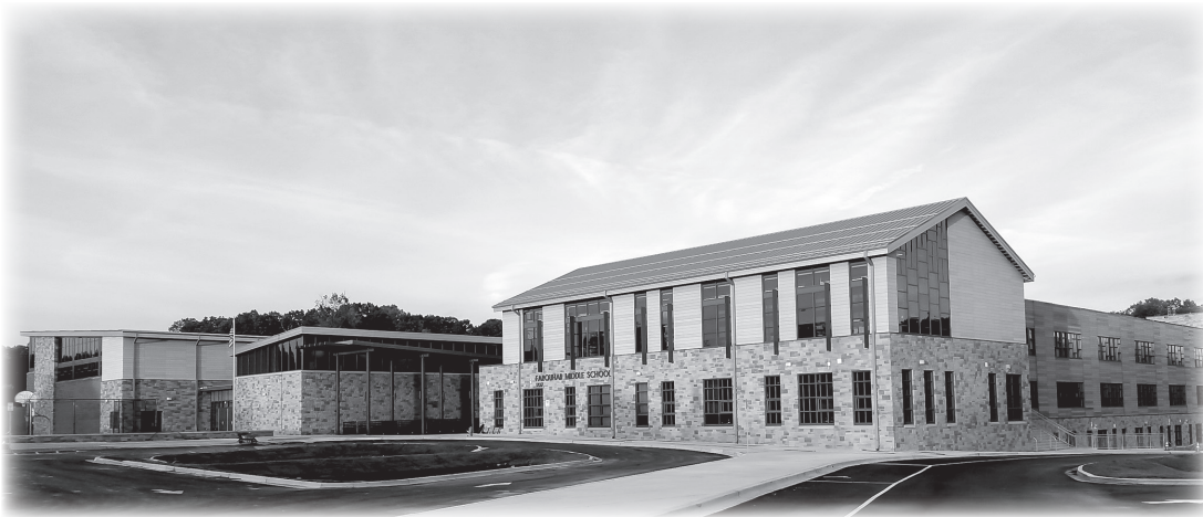
William H. Farquar Middle School

*Relocatables on site to address overutilization