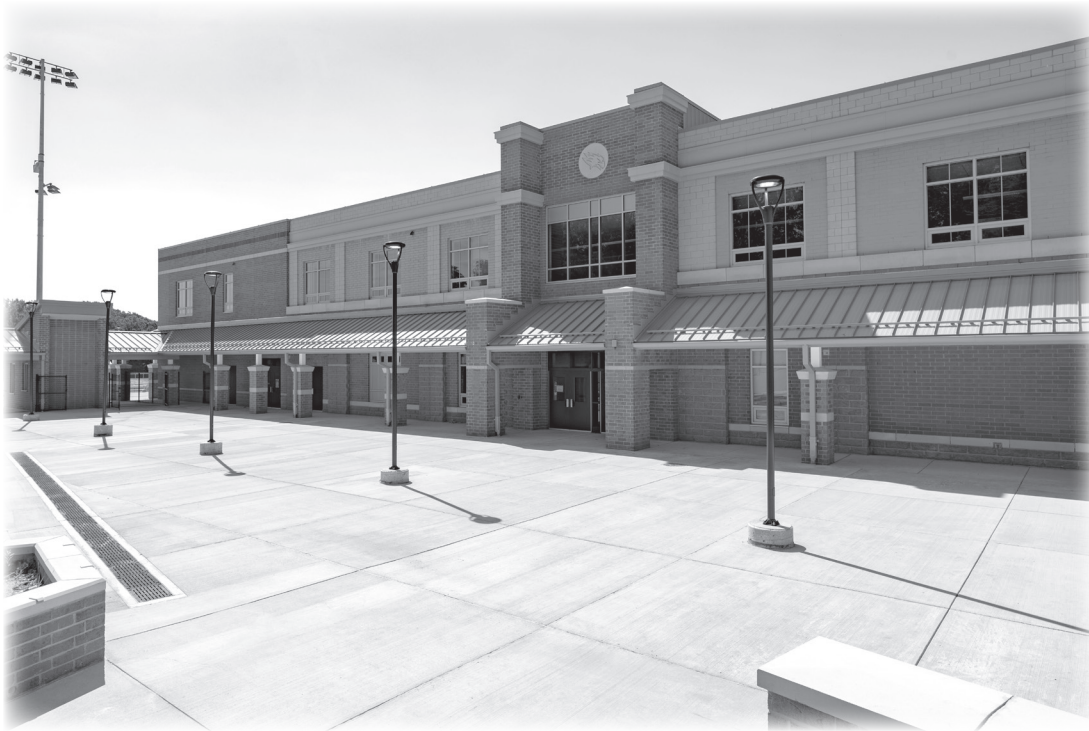
Seneca Valley High School

*Relocatables on site to address overutilization