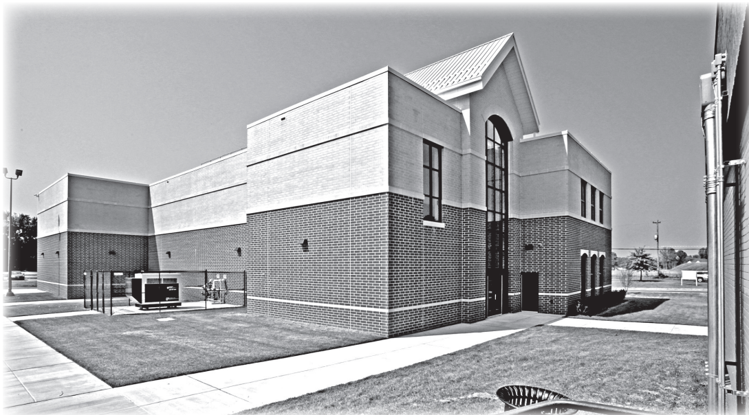
Poolesville High School