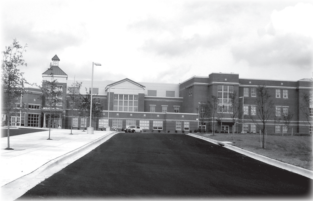
Lakelands Park Middle School

** Spark M. Matsunaga ES is colocated with Longview School