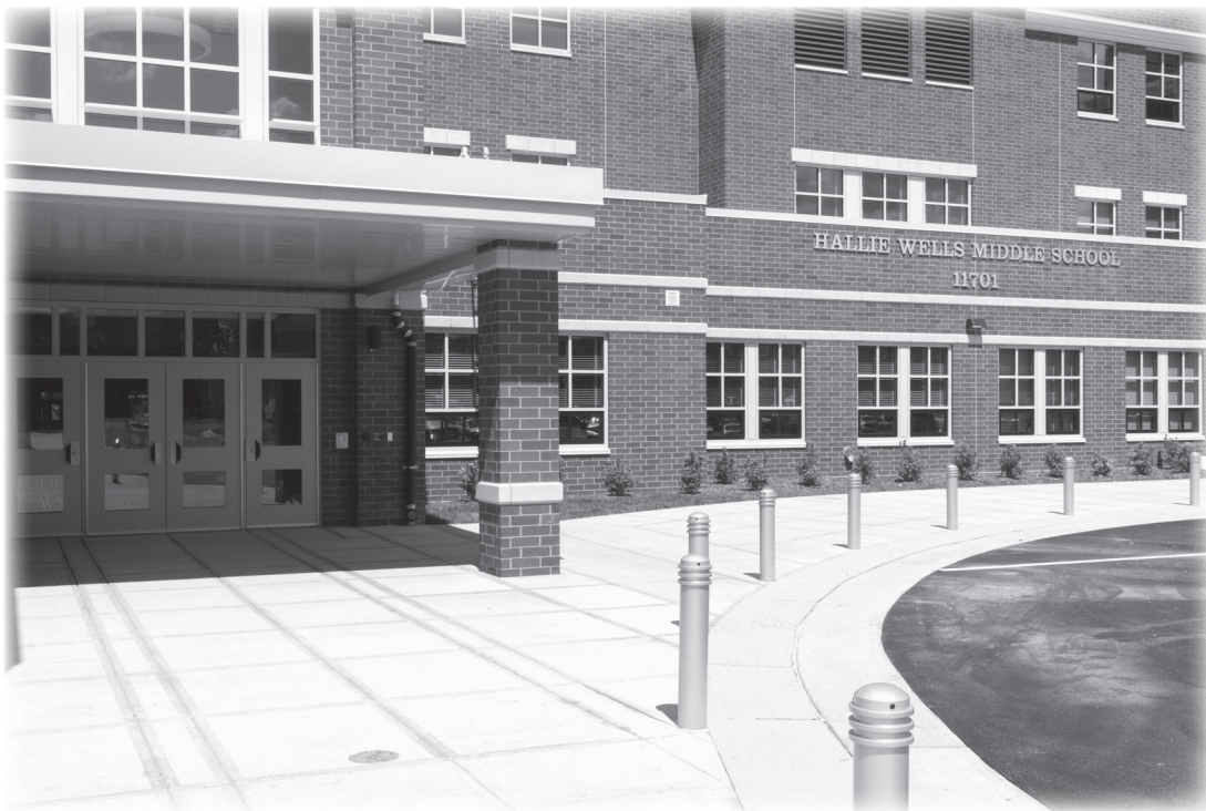
Hallie Wells Middle School

*Relocatables on site to address overutilization