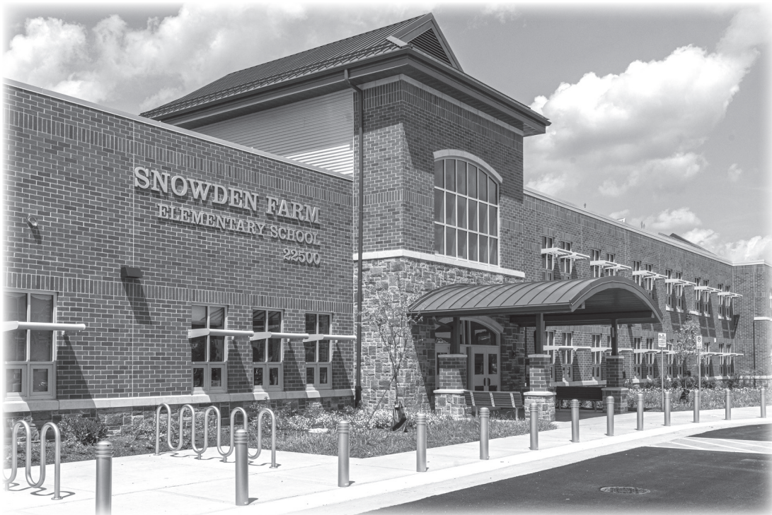
Snowden Farm Elementary School

*“Proposed”—Project has facility planning funds approved for a feasibility study.