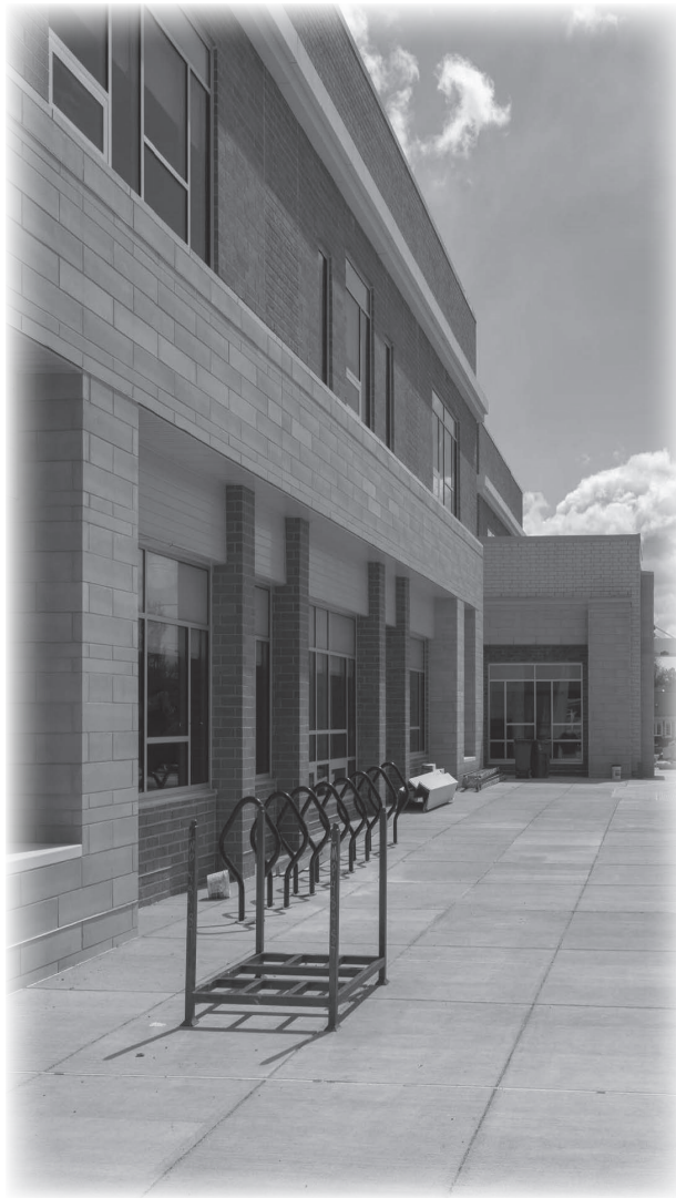
Potomac Elementary School

*Relocatables on site to address overutilization