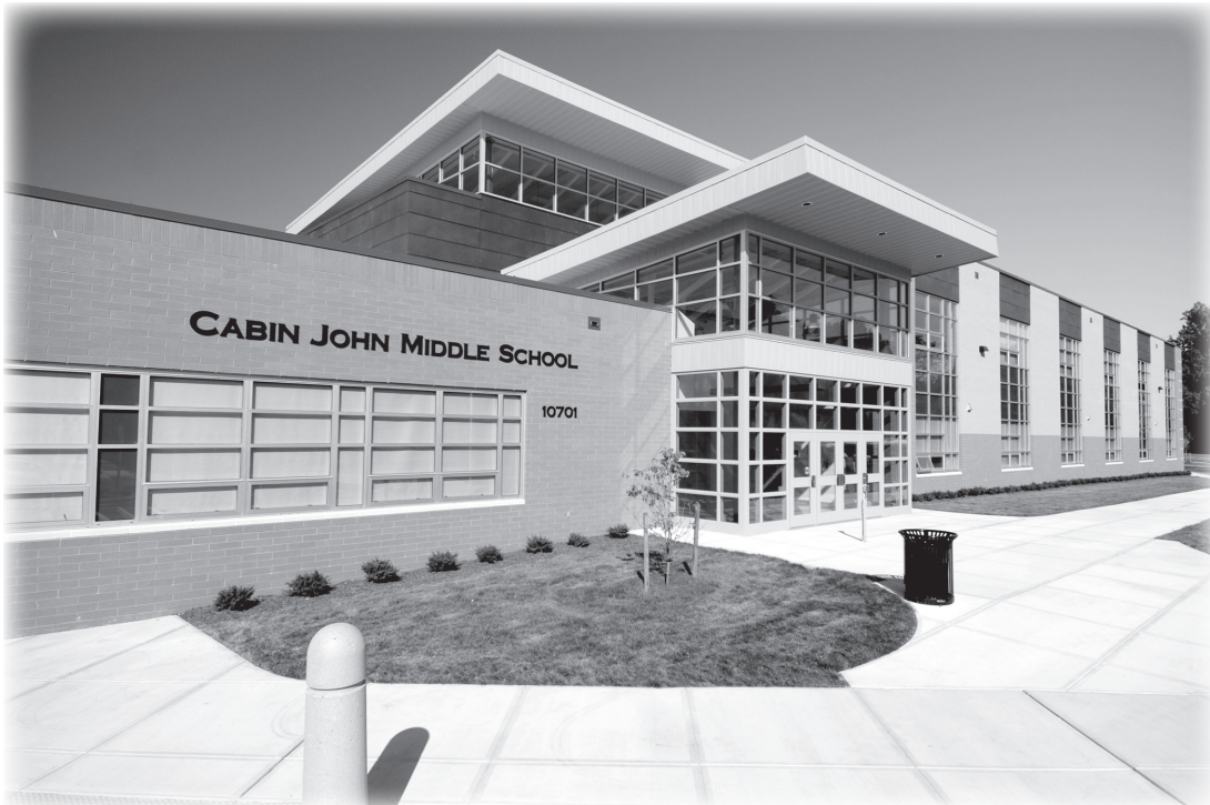
Cabin John Middle School

*Proposed—Project has facility planning funds approved for a feasibility study.