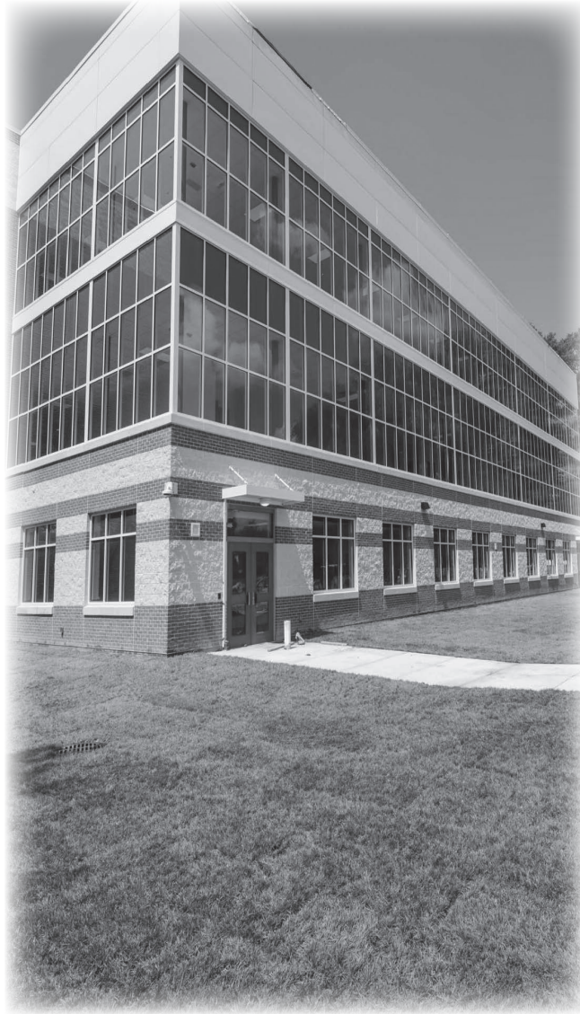
Walt Whitman High School