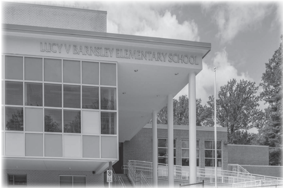
Lucy V. Barnsley Elementary School