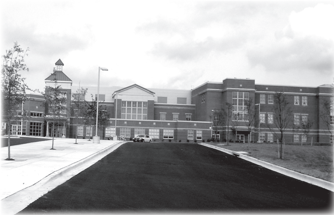
Lakelands Park Middle School