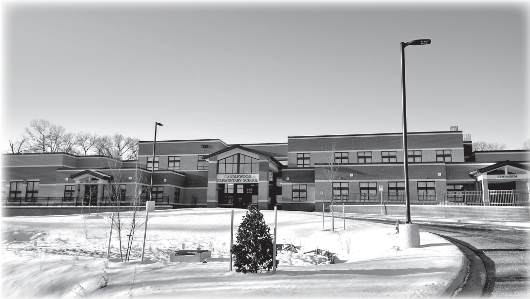
Candlewood Elementary School