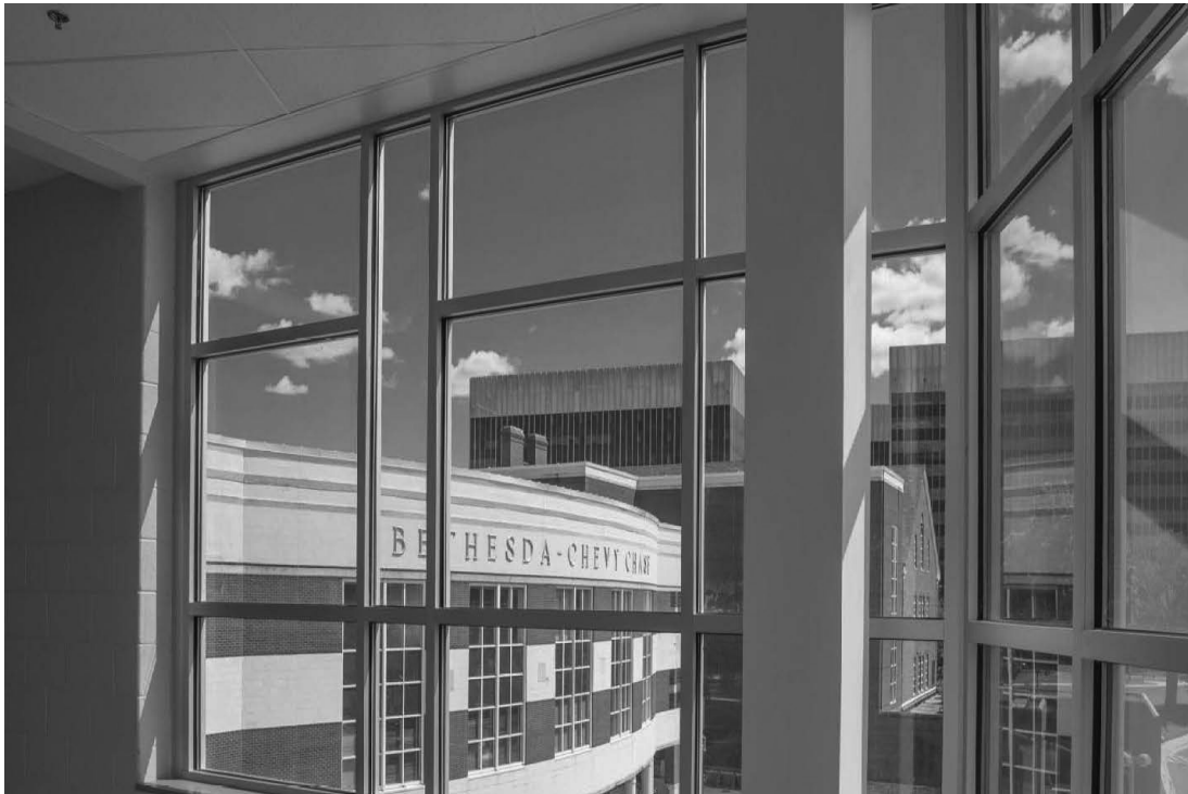
Bethesda-Chevy Chase High School