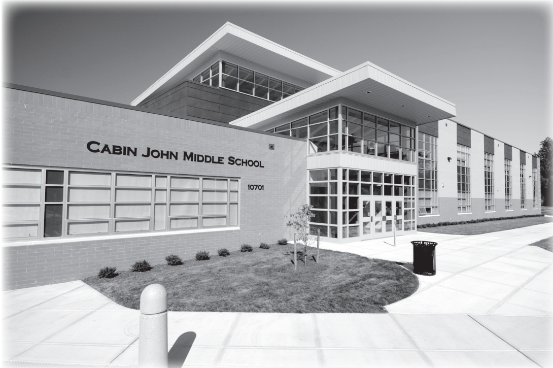
Cabin John Middle School

*“Proposed”—Project has facility planning funds approved for a feasibility study.