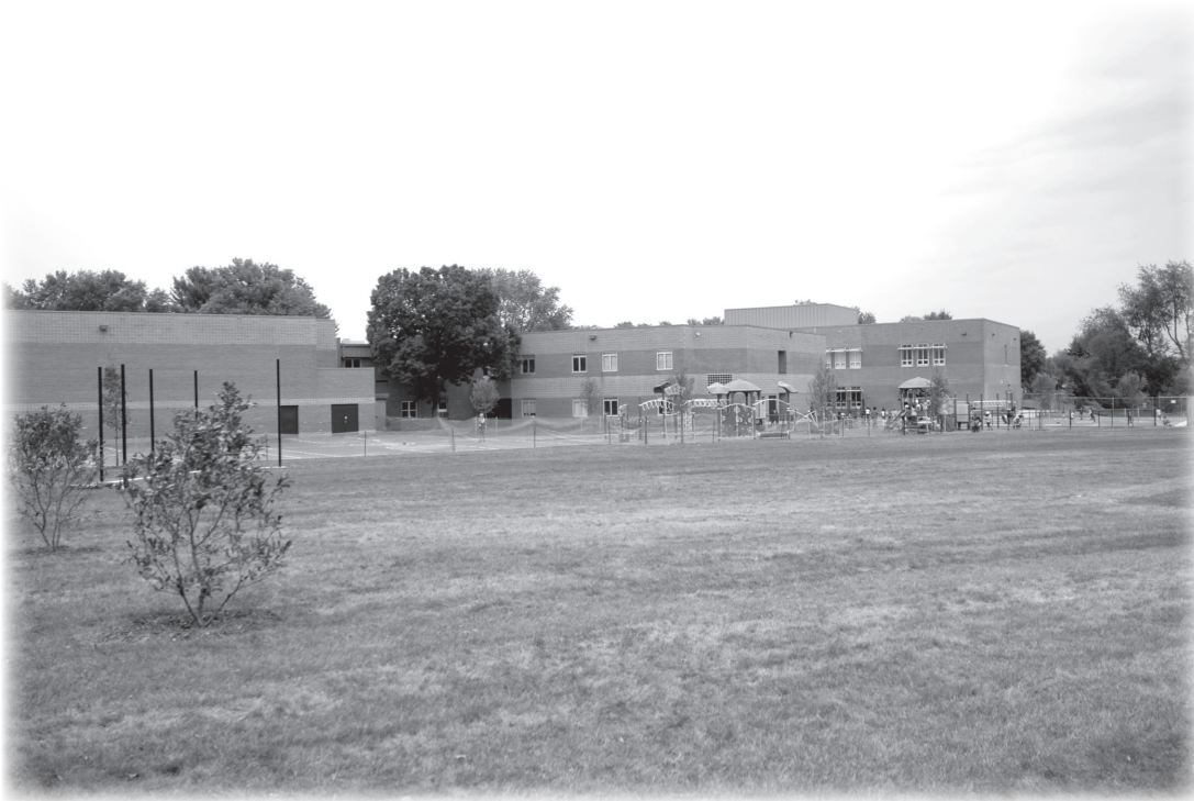
Whetstone Elementary School

Proposed—Project has facility planning funds approved for a feasibility study.