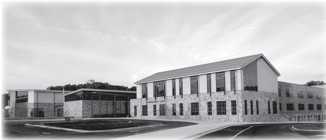
William H. Farquar Middle School