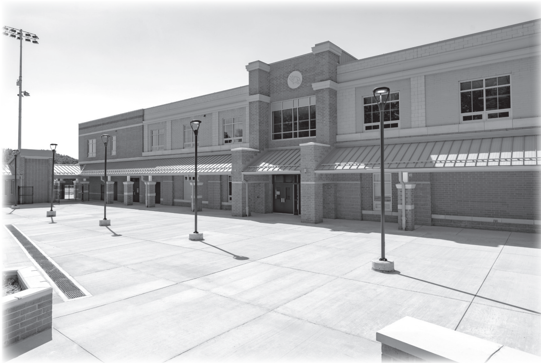
Seneca Valley High School