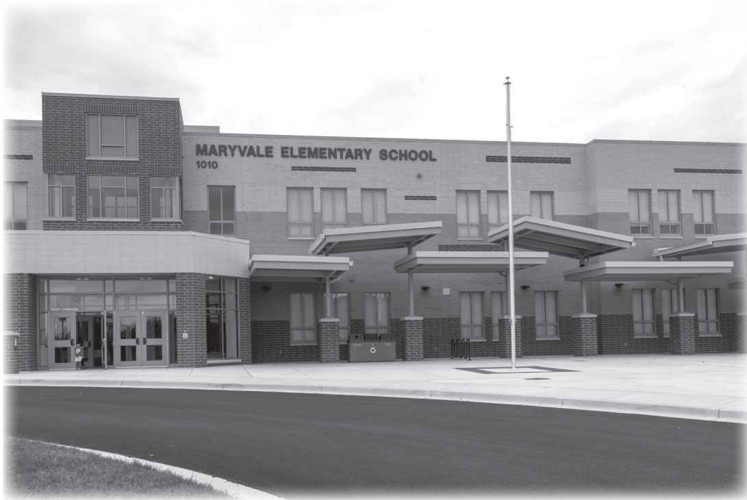
Maryvale Elementary School