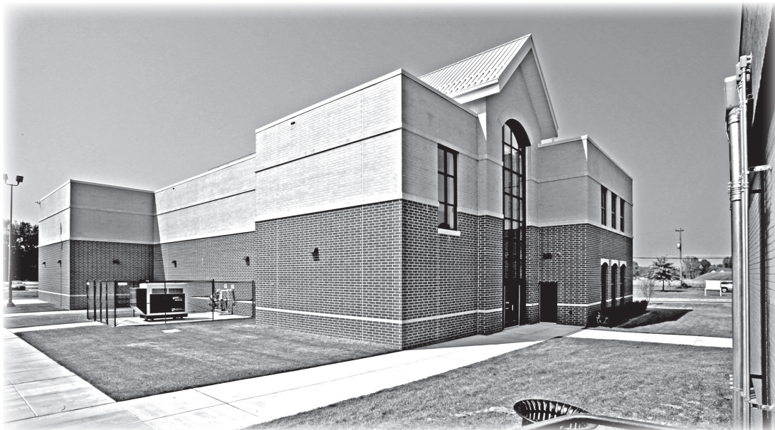
Poolesville High School