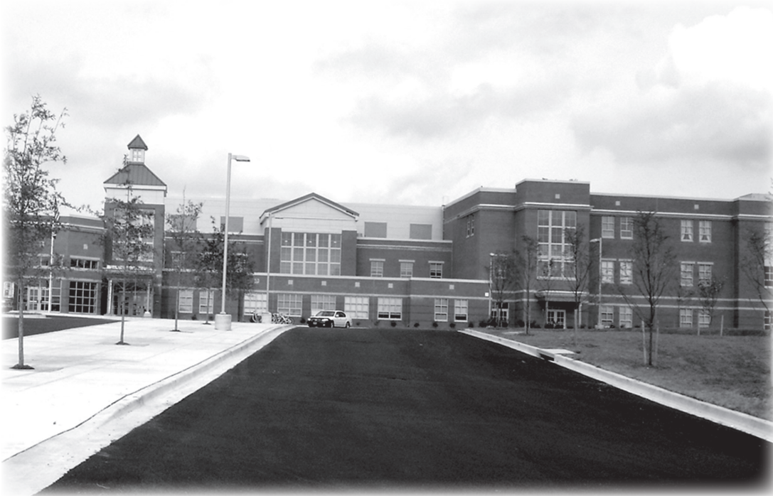
Lakelands Park Middle School