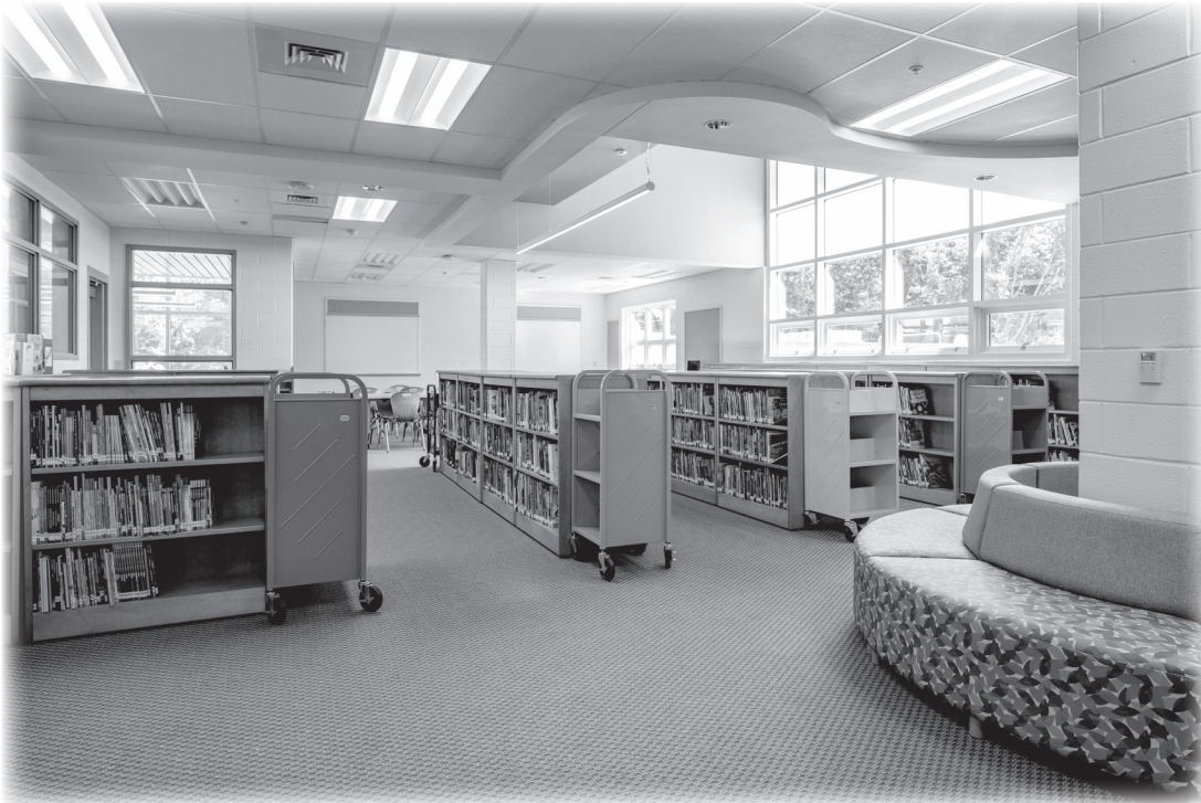
Bayard Rustin Elementary School