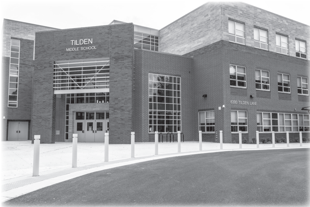
Tilden Middle School