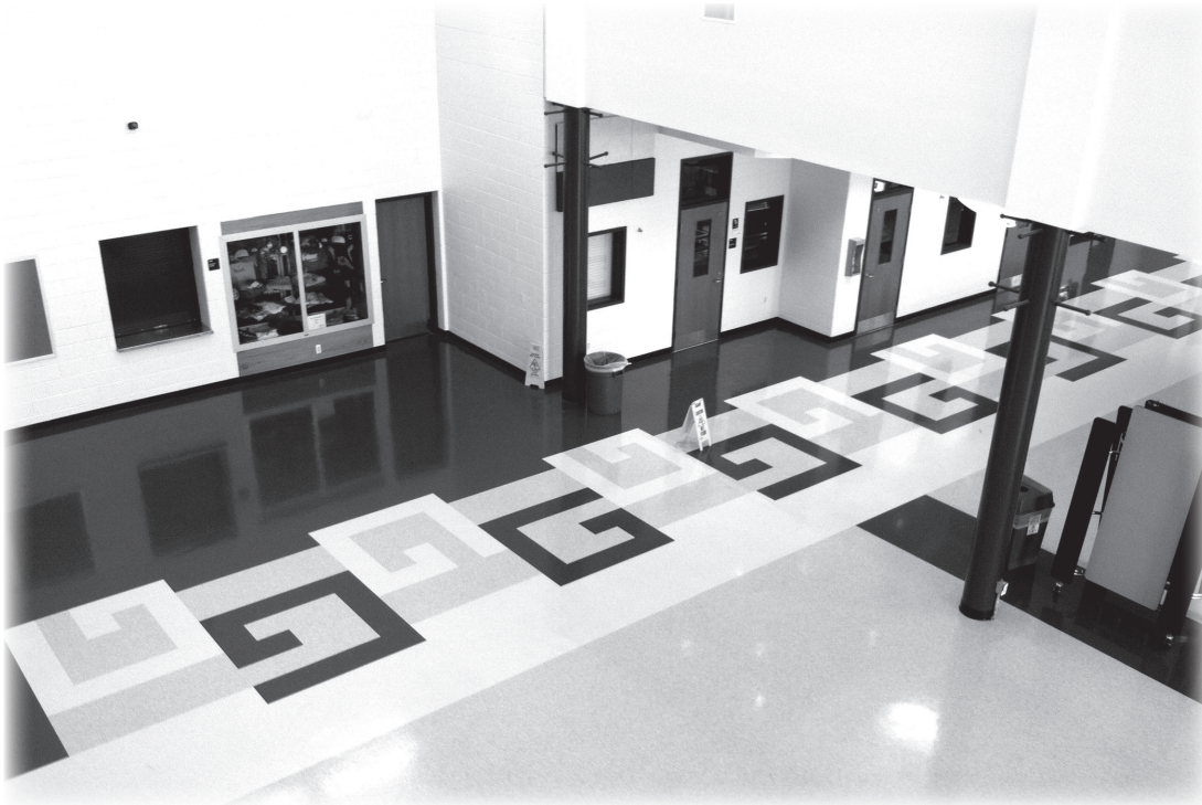
Gaithersburg High School