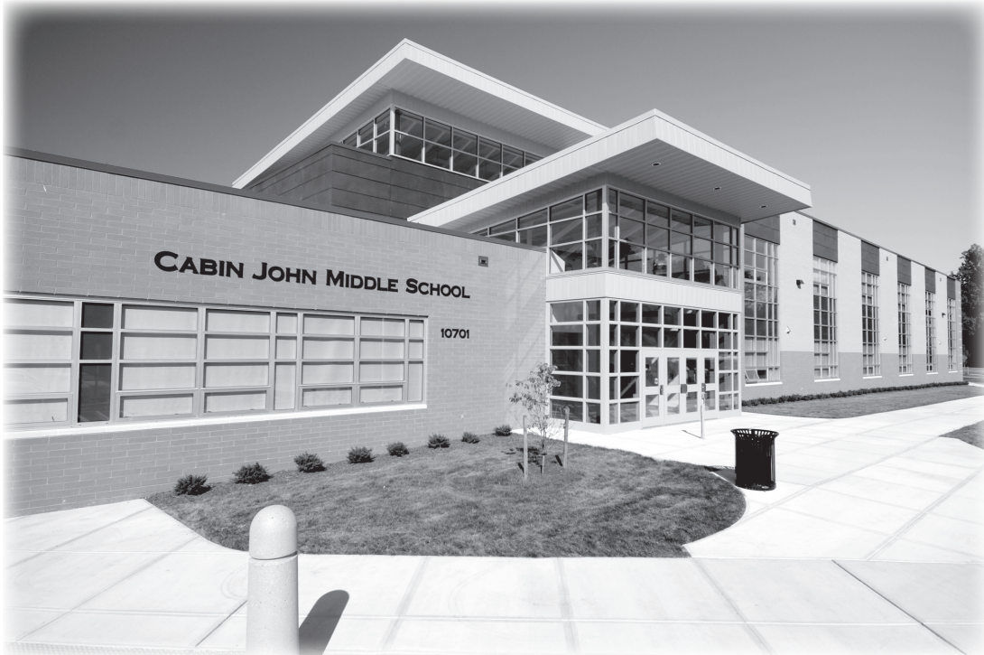
Cabin John Middle School

*Proposed—Project has facility planning funds approved for a feasibility study.