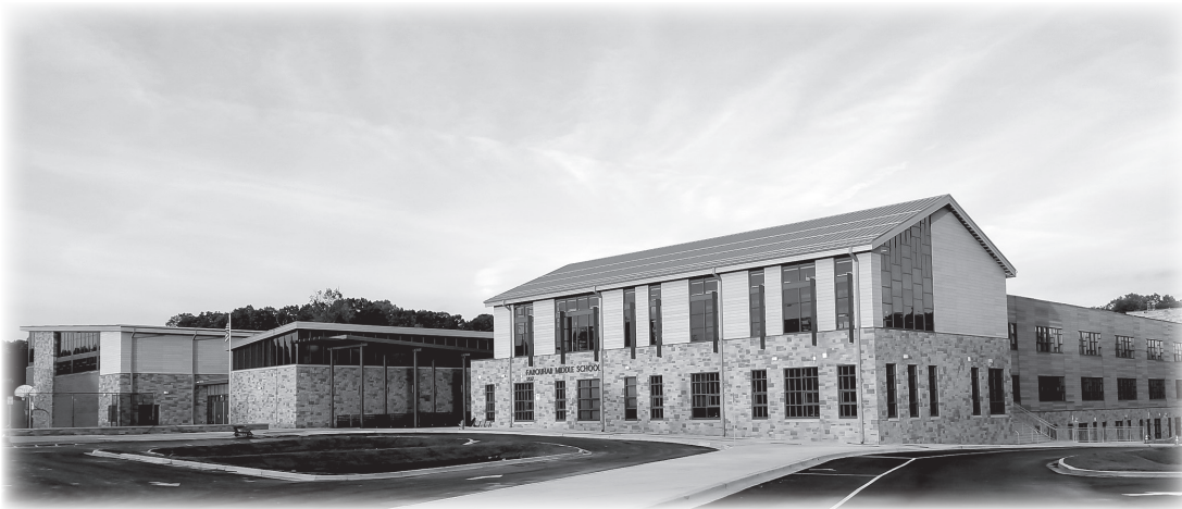
William H. Farquhar Middle School

*Relocatables on site to address overutilization