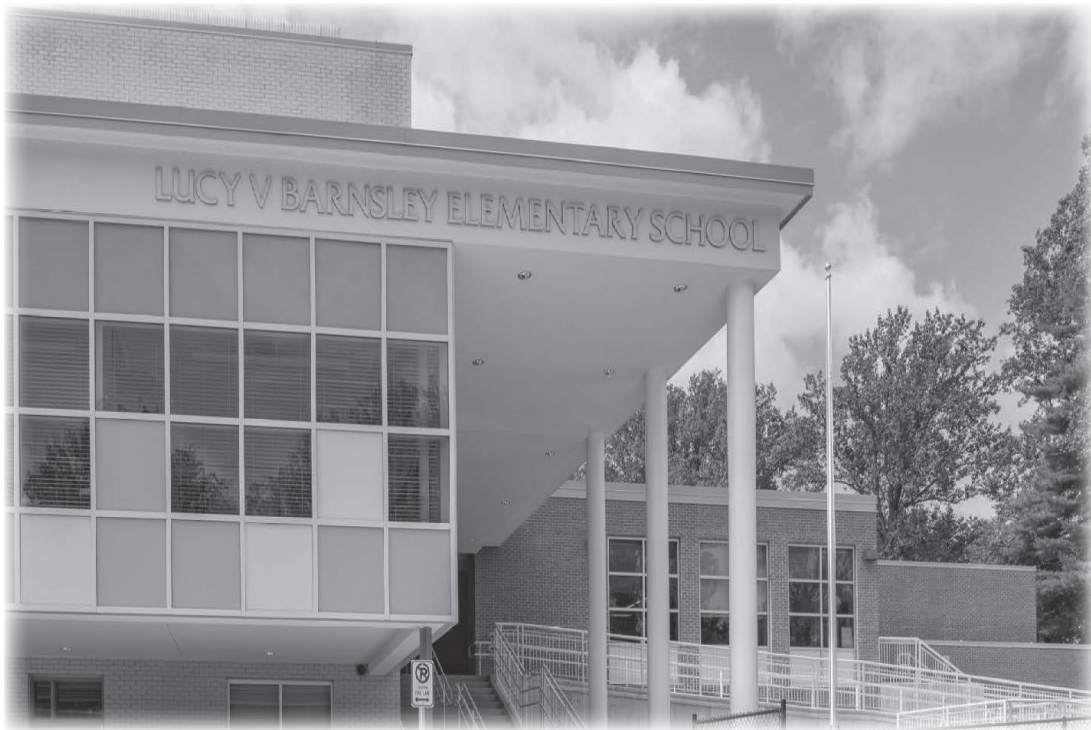
Lucy V. Barnsley Elementary School

*Relocatables on site to address overutilization