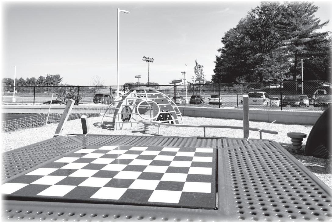
Brown Station Elementary School

*Relocatables on site to address overutilization