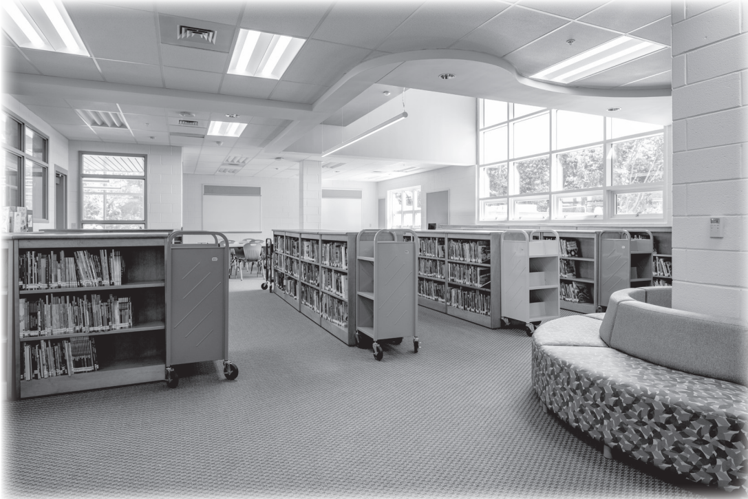
Bayard Rustin Elementary School

*Relocatables on site to address overutilization