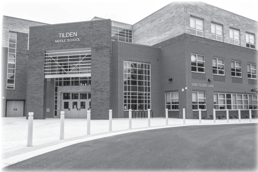
Tilden Middle School

*Relocatables on site to address overutilization