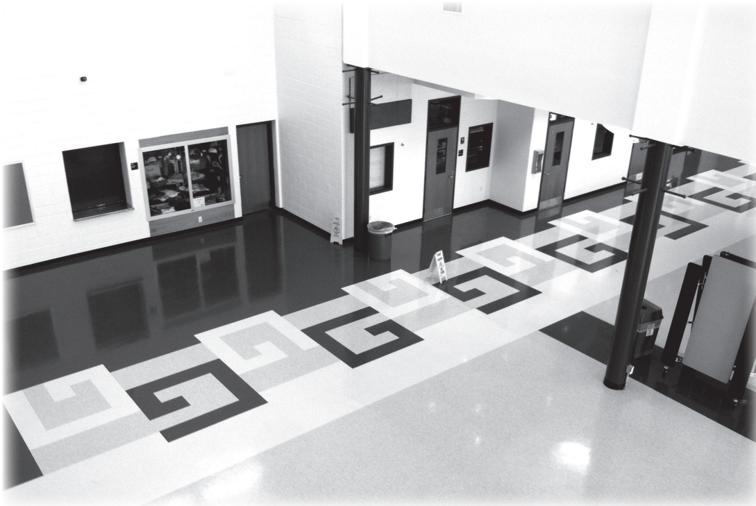
Gaithersburg High School

*Relocatables on site to address overutilization