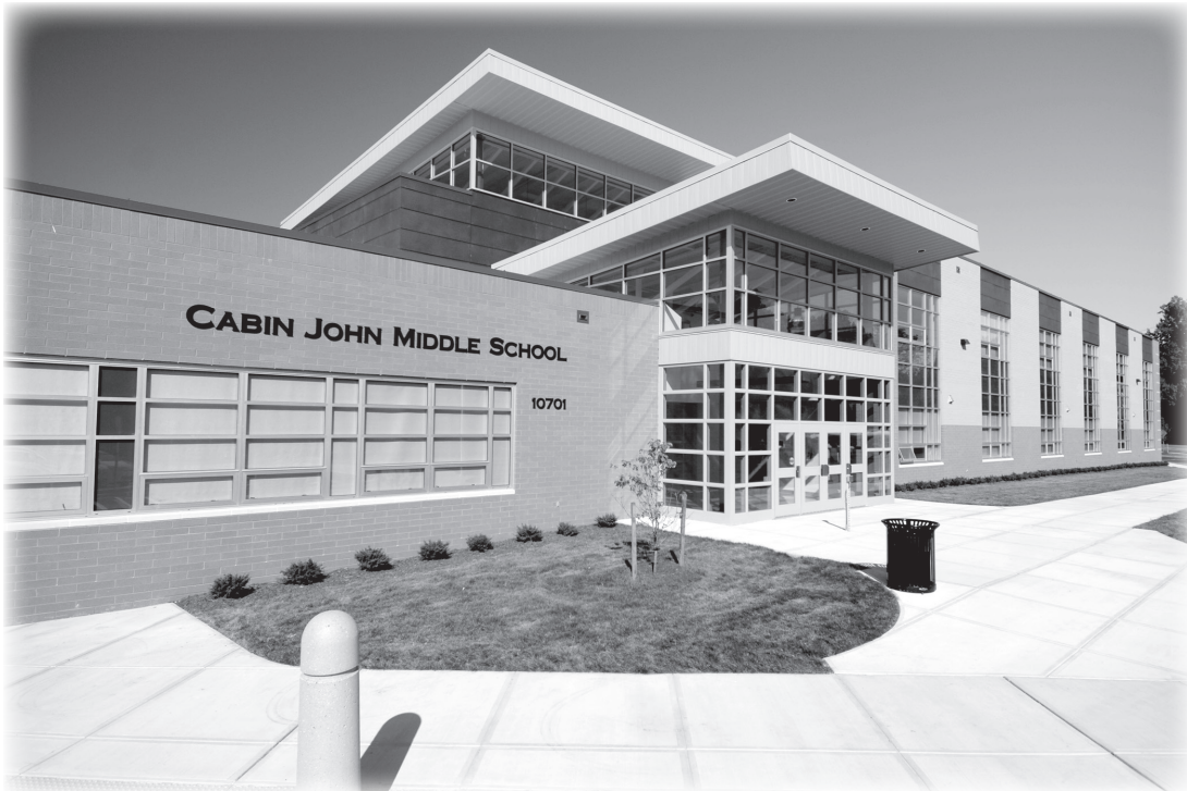
Cabin John Middle School

“Recommended”—Project has a recommended FY 2023 appropriation for planning or construction in the FY 2023–2028 CIP.