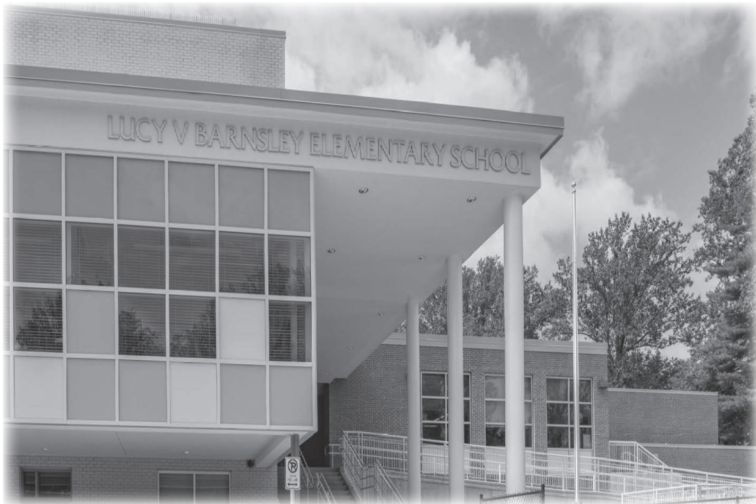
Lucy V. Barnsley Elementary School