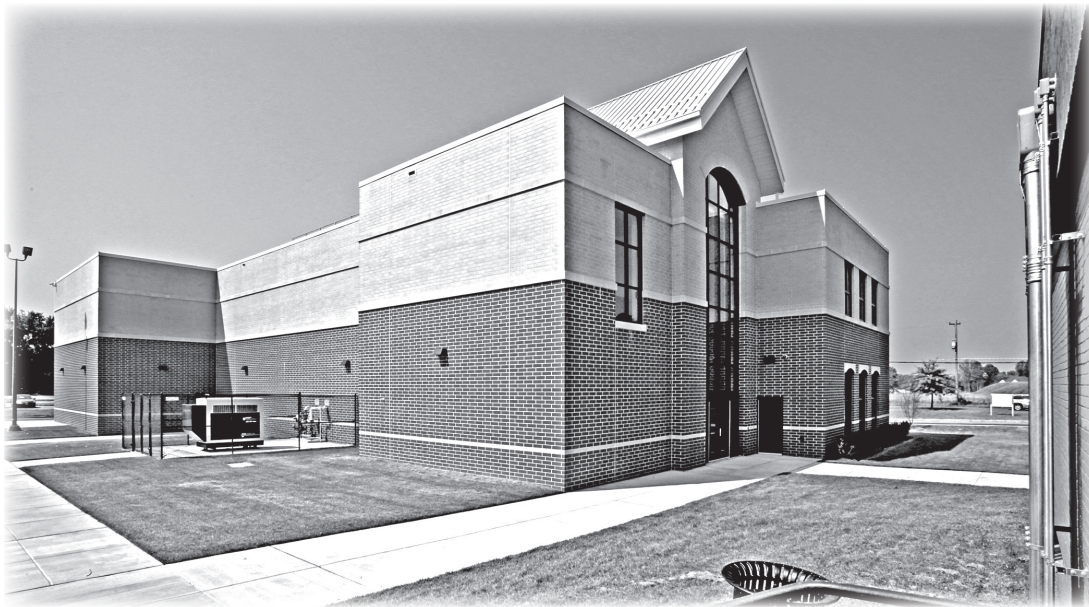
Poolesville High School