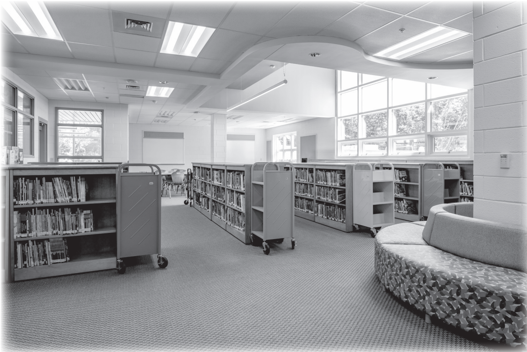
Bayard Rustin Elementary School