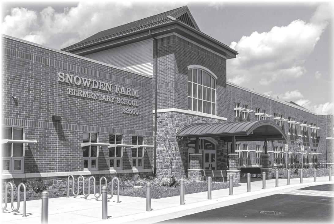
Snowden Farm Elementary School

*“Recommended”—Project has a recommended FY 2023 appropriation for planning or construction in the FY 2023–2028 CIP.