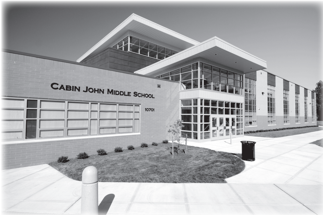
Cabin John Middle School

*“Proposed”—Project has facility planning funds approved for a feasibility study.