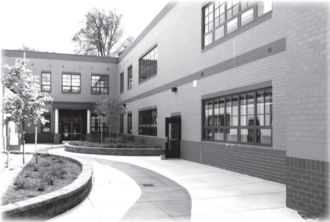
Wood Acres Elementary School