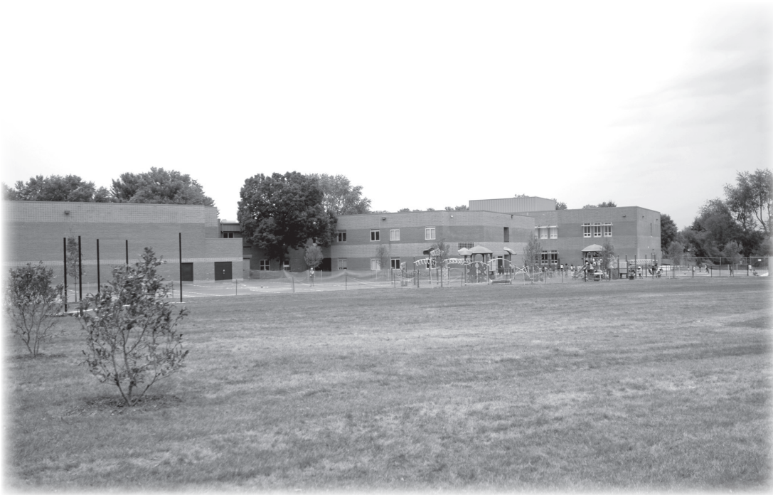
Whetstone Elementary School

*“Proposed”—Project has facility planning funds approved for a feasibility study.