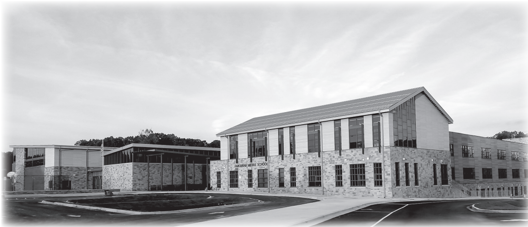
William H. Farquhar Middle School