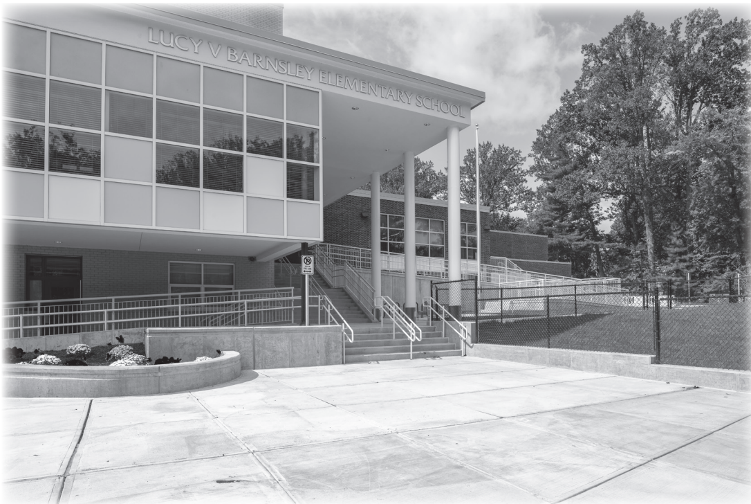
Lucy V. Barnsley Elementary School