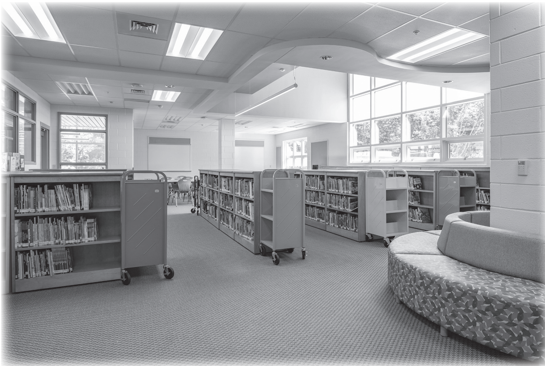
Bayard Rustin Elementary School