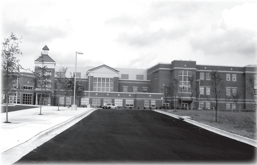
Lakelands Park Middle School