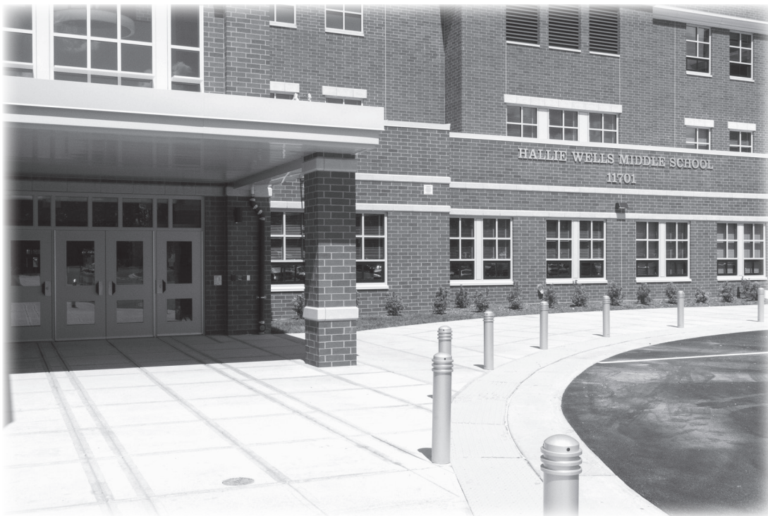
Hallie Wells Middle School