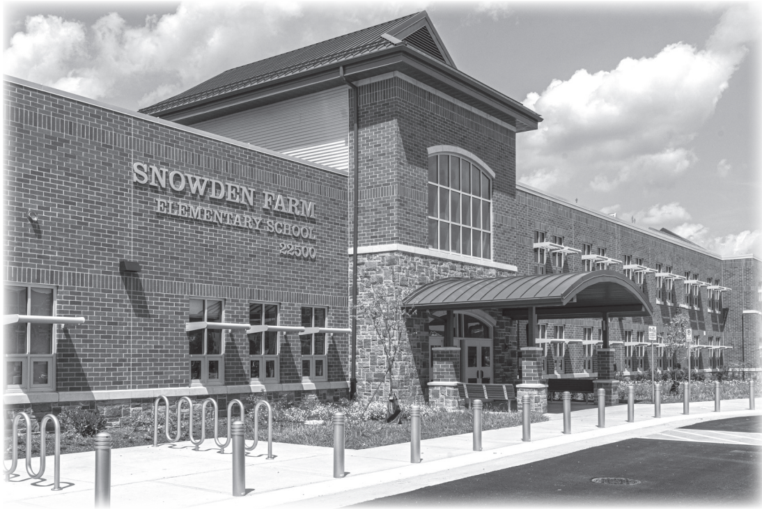
Snowden Farm Elementary School