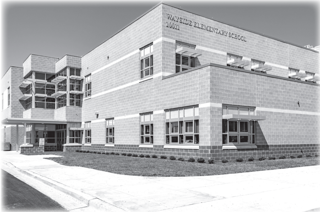
Wayside Elementary School